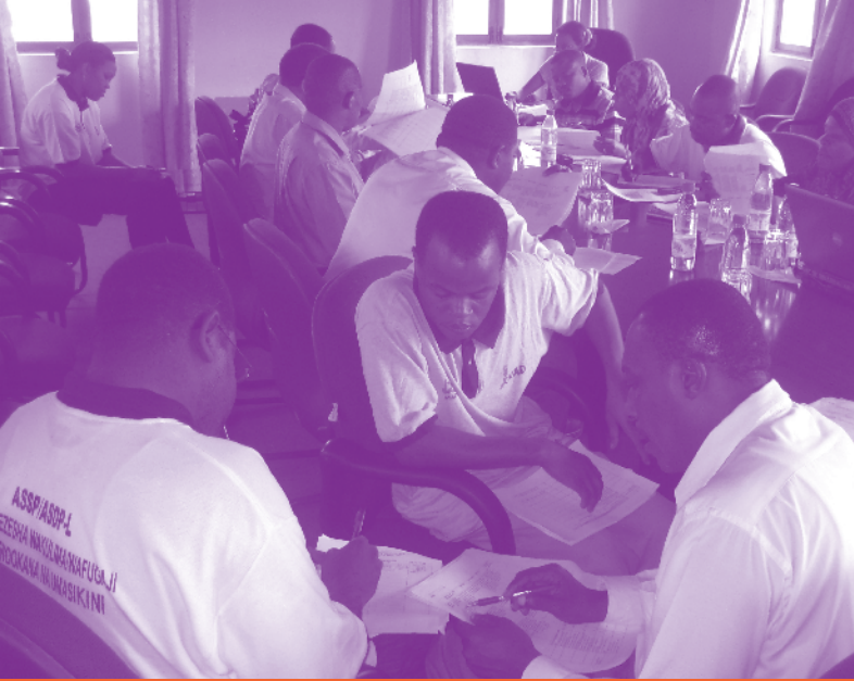
Learning workshop in Zanzibar, Tanzania.

Other activities will include creating and ensuring access to technical learning materials that can be used by individuals and organizations in developing countries.