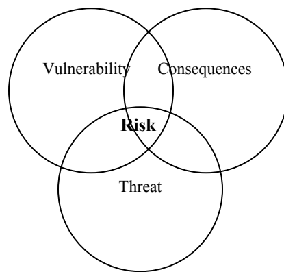
Figure 1. Overlapping regions of high threat, vulnerability, and consequence great security risk.

as attack against the available alternatives. Vulnerability could be estimated as likelihood of port interception and the consequences would be an assessment of the impact of the disease. Threat, Vulnerability, Consequence analysis is an interactive approach designed to elicit areas where high threat levels, extreme vulnerabilities, and high consequences overlap (Figure 1). It is the intersection of these events that cause security concerns. The following section discusses in more detail which factors have to be considered when applying this framework to agroterrorism.