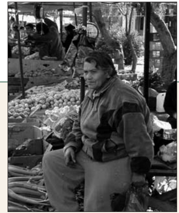
© 2006 Juan Carlos Ruiz Godoy